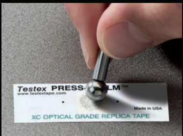
For use with OPTICAL Grade Testex<sup>™</sup> Press-0-Film<sup>™</sup> Replica Tape

Measures and records surface profile parameters using replica tape