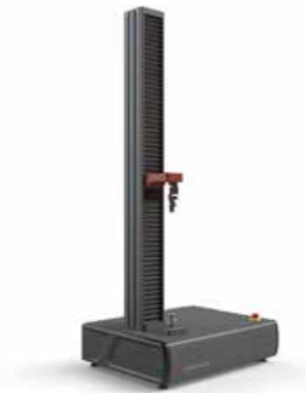
Table model frames

If you have large parts and components to test, or just stronger materials, our floor frames are the business. They can generate powerful forces from 100kN to 600kN, while our servo-hydraulic frames take things to a whopping 2,000 kN. Your poor samples don't stand a chance!